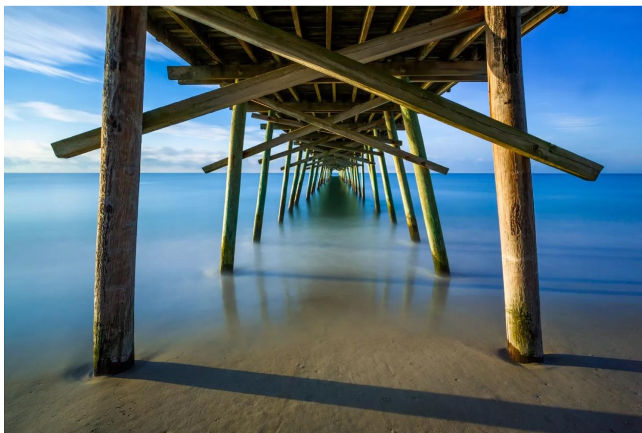
The Bogue Inlet Pier at Emerald Isle, North Carolina.