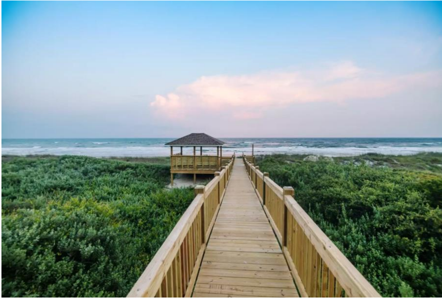
Pier shot with beach and ocean in the background at Emerald Isle.