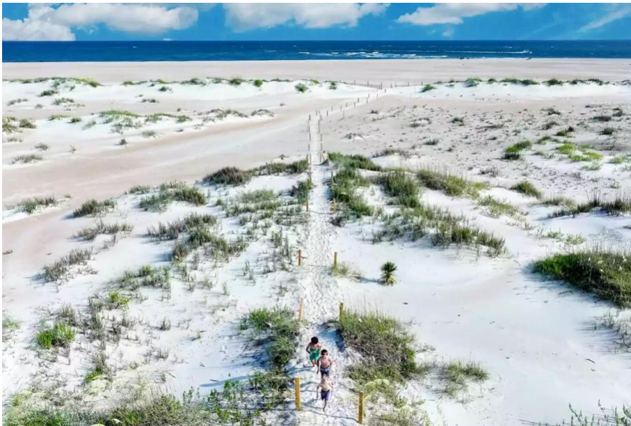
Aerial view of young boys running on the beach.