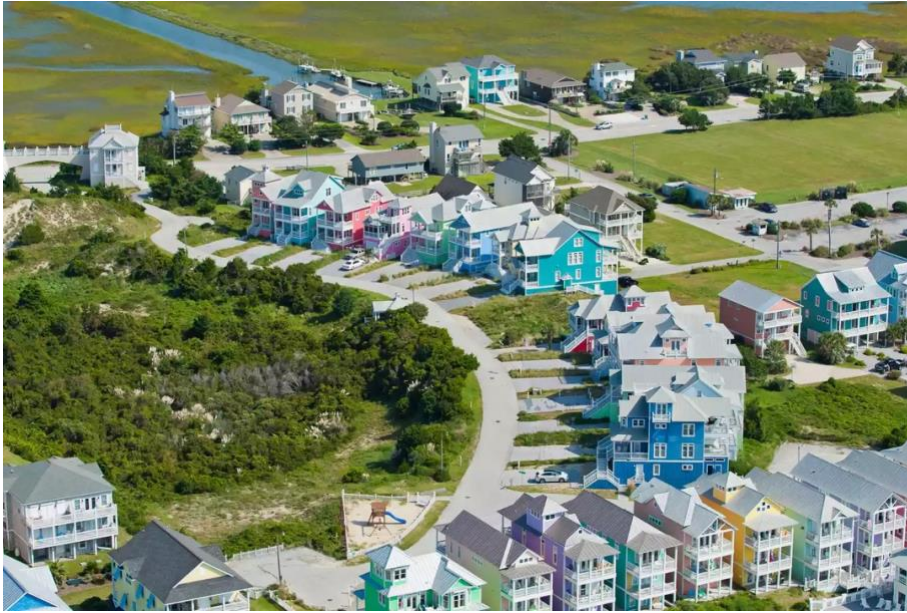
Aerial view of colorful beach homes.