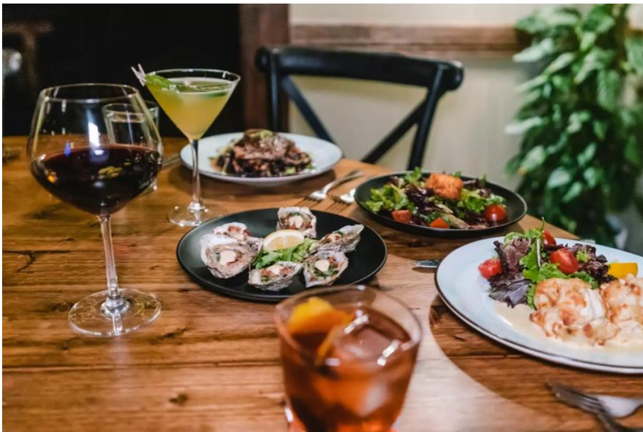
Seafood dishes from Caribsea.