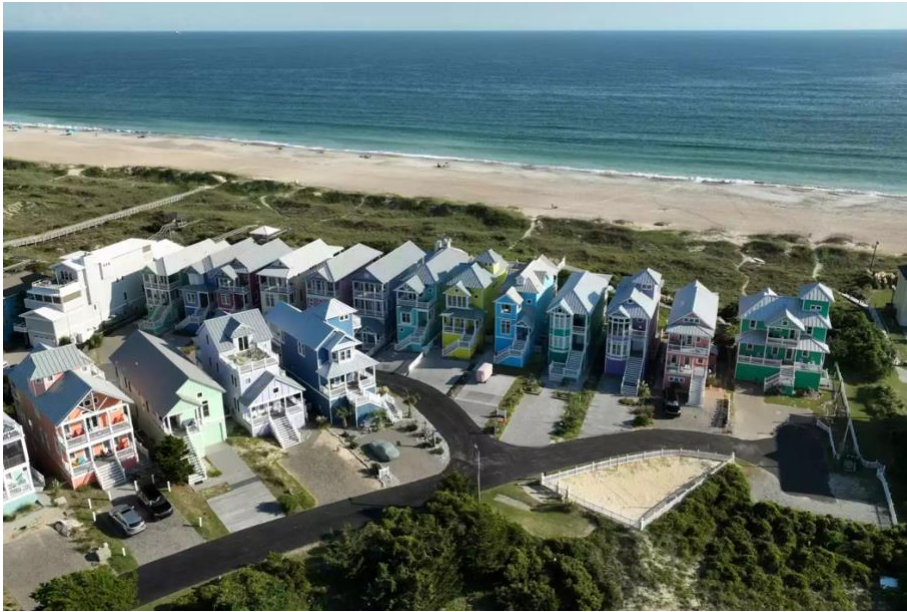
Aerial view of beach houses along the coast.