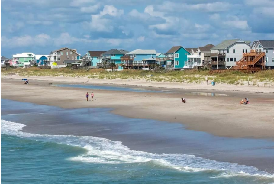
Aerial view of people walking on an Emerald Isle beach.