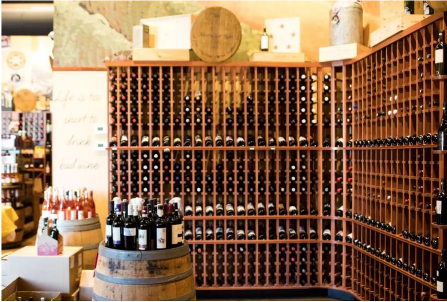
Interior shelves at Emerald Isle Wine Market.